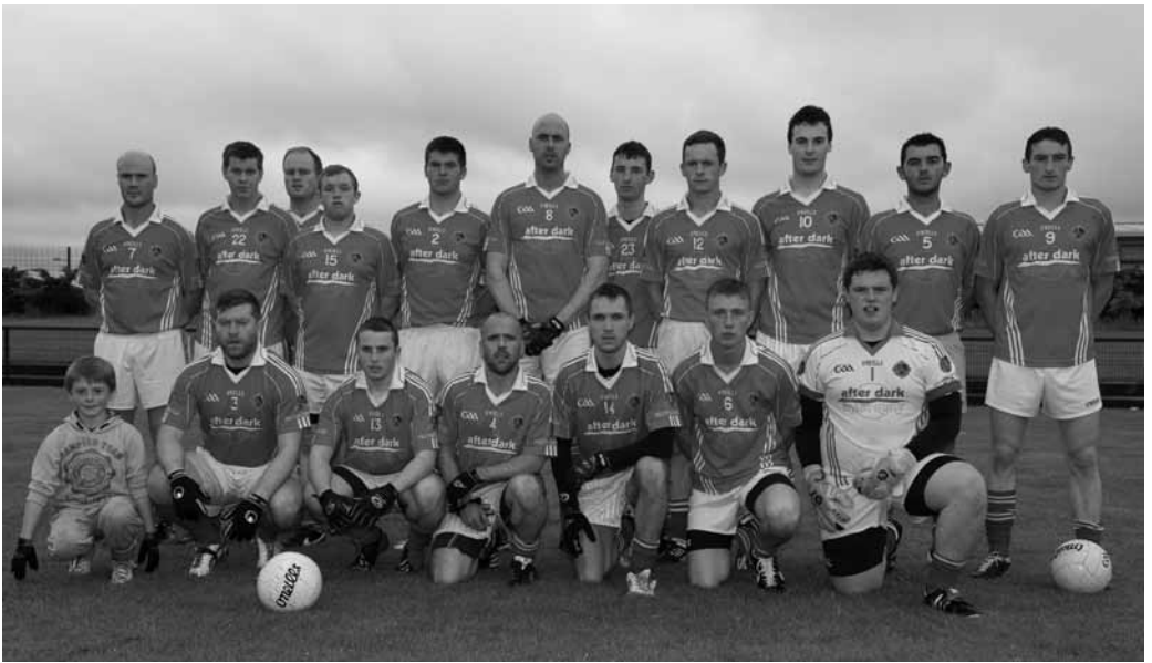
Our current Intermediate team.