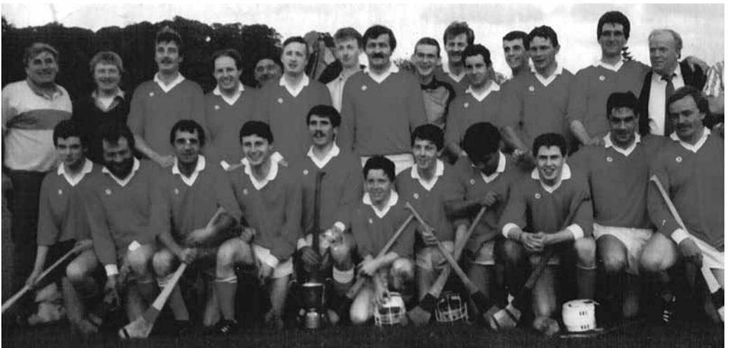
1988 Junior A Hurling Champions.