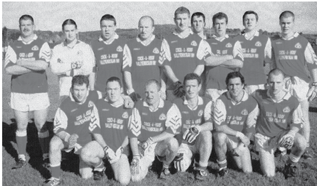
Junior A 1998.