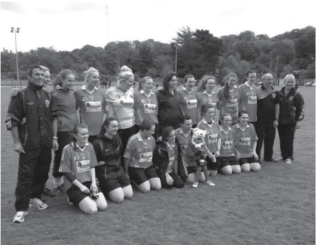
Our Ladies team that won the Senior Cup in 2012.