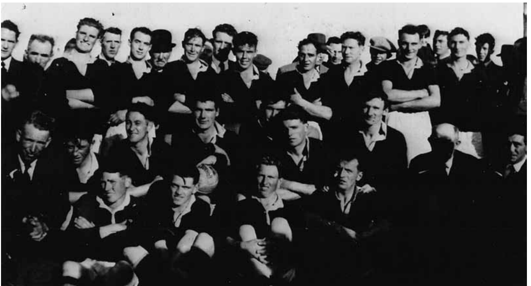
The 1952 Intermediate Champions.