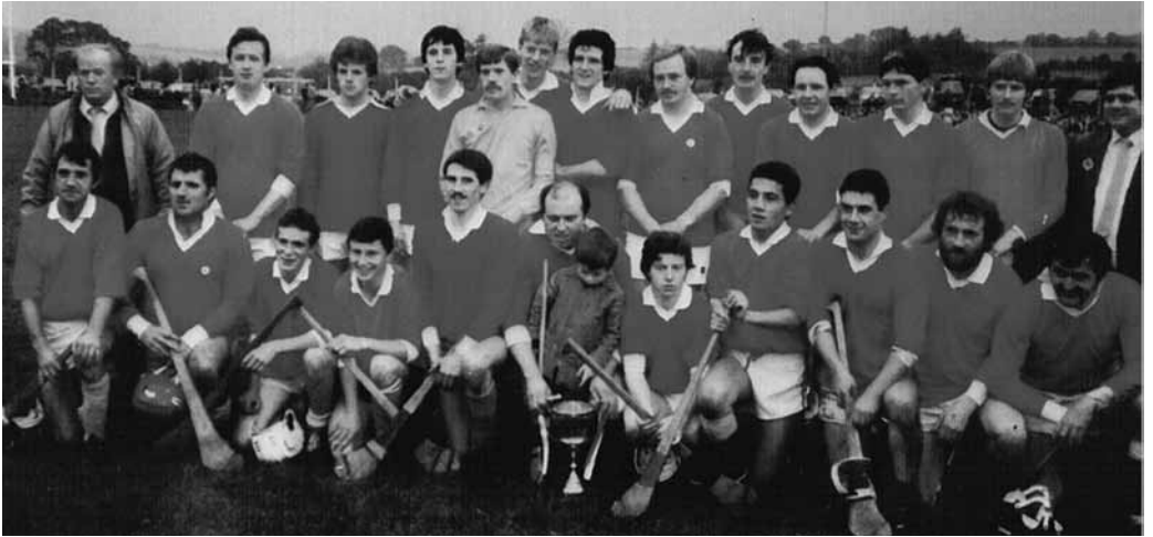
1985 Junior B Hurling Champions.