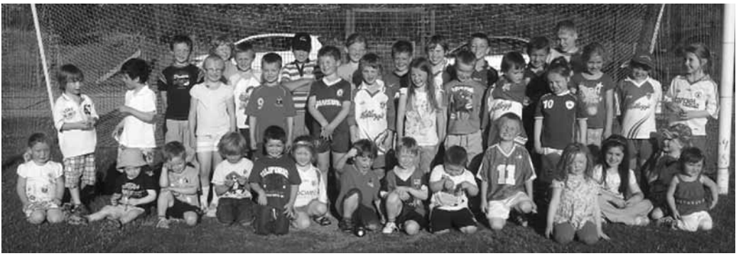
Our current crop of Go Games players.