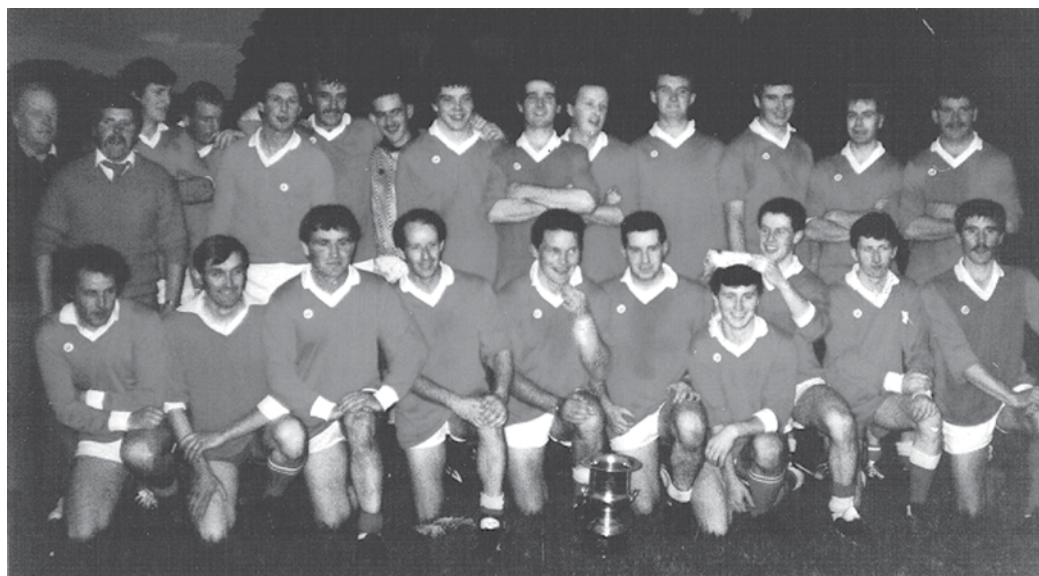
1989 Intermediate Football Champions.