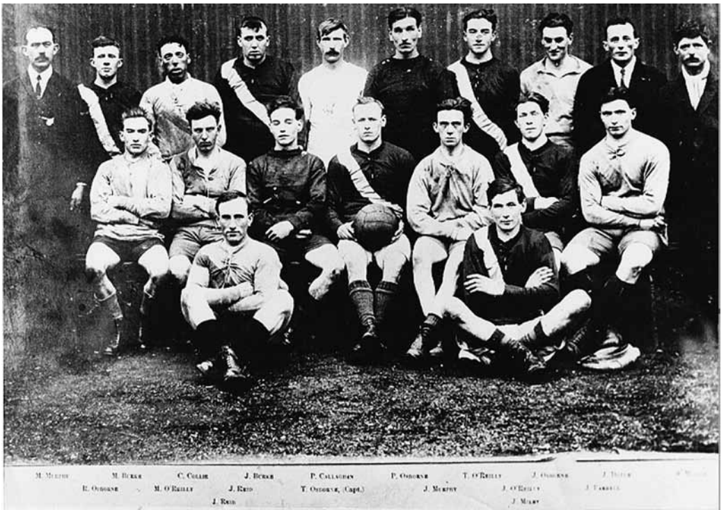
A picture of the Granabeg 1923 Senior Champions.